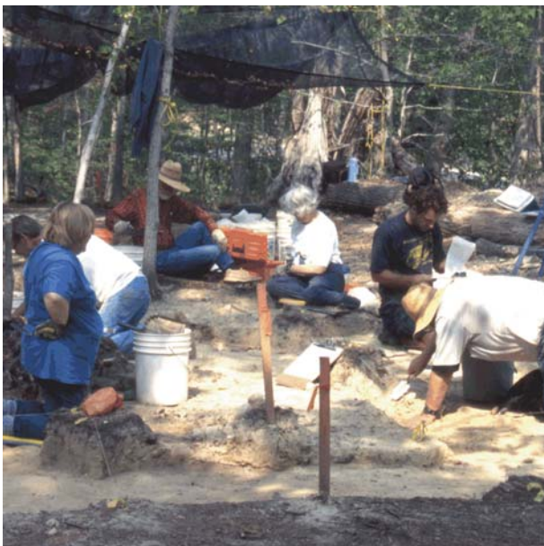
Excavation - David Site