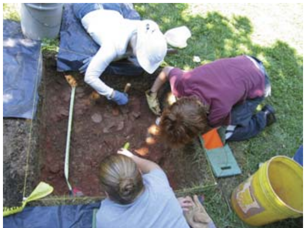
Excavation - Colvin Mill Site