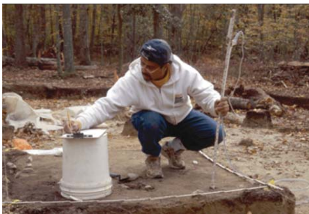
Excavation - David Site