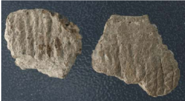
Ceramics - David Site