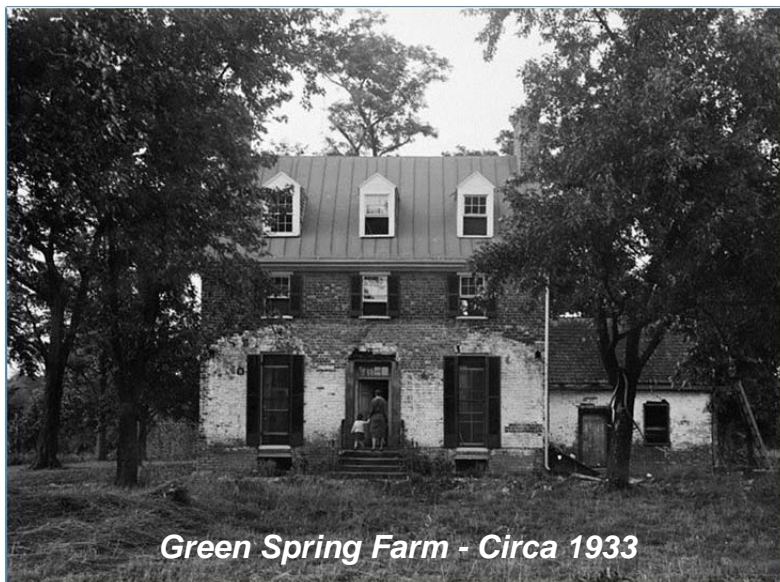
Green Spring Farm - Circa 1933

http://www.fairfaxcounty.gov/parks/greenspring/manor.htm