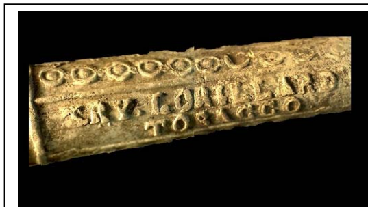
Lorillard's Tobacco Promotional Pipe Excavated at Ellanor C. Lawrence Park